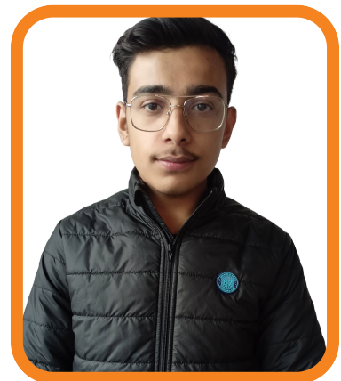
RUDER DEEP BANSAL NOIDA