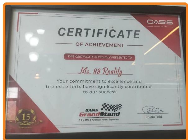
Team Noida being awarded with "Certificate of Achievement" by Oasis Group for its outstanding sales performance for Oasis Grandstand.