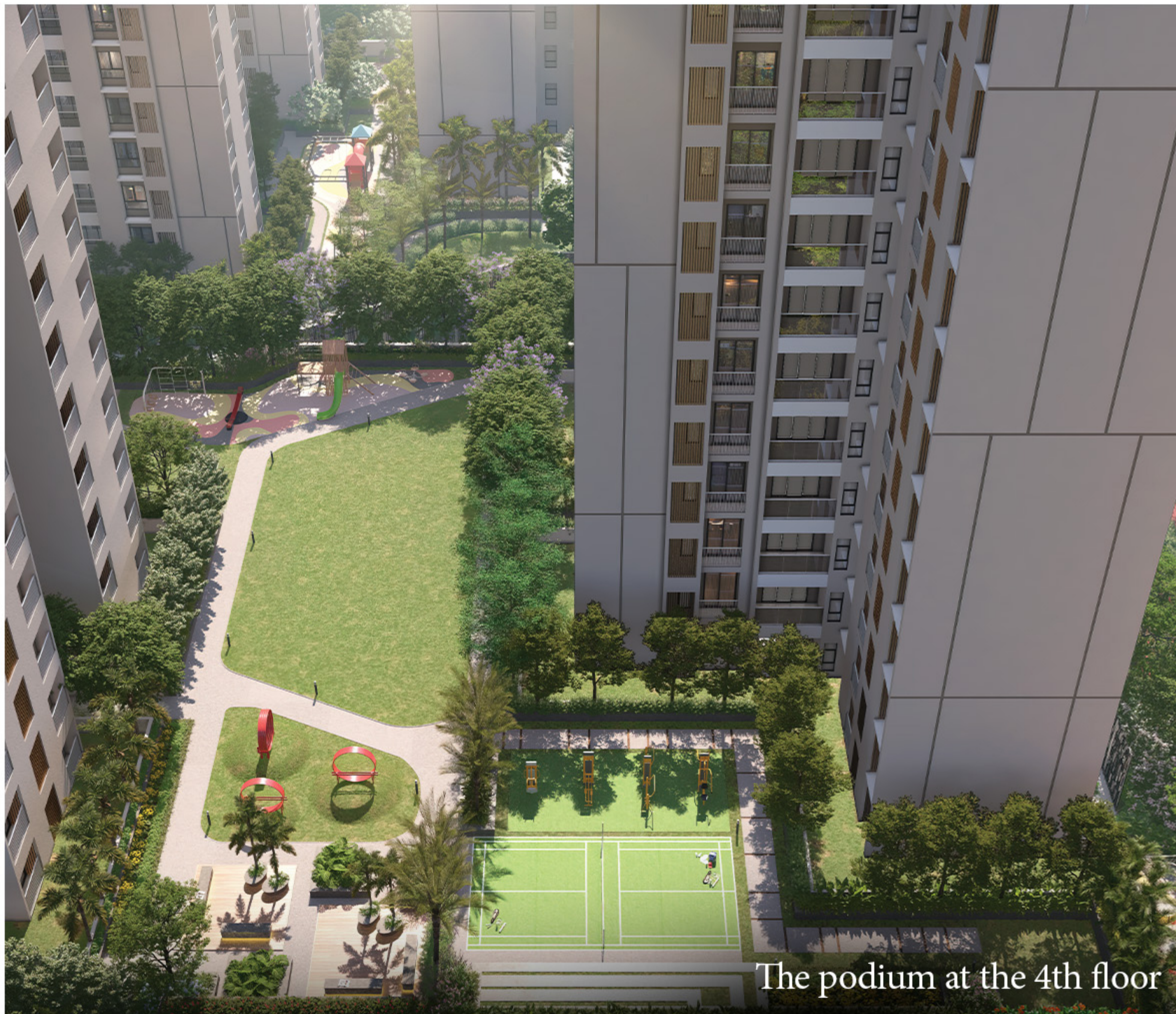
The podium at the 4th floor