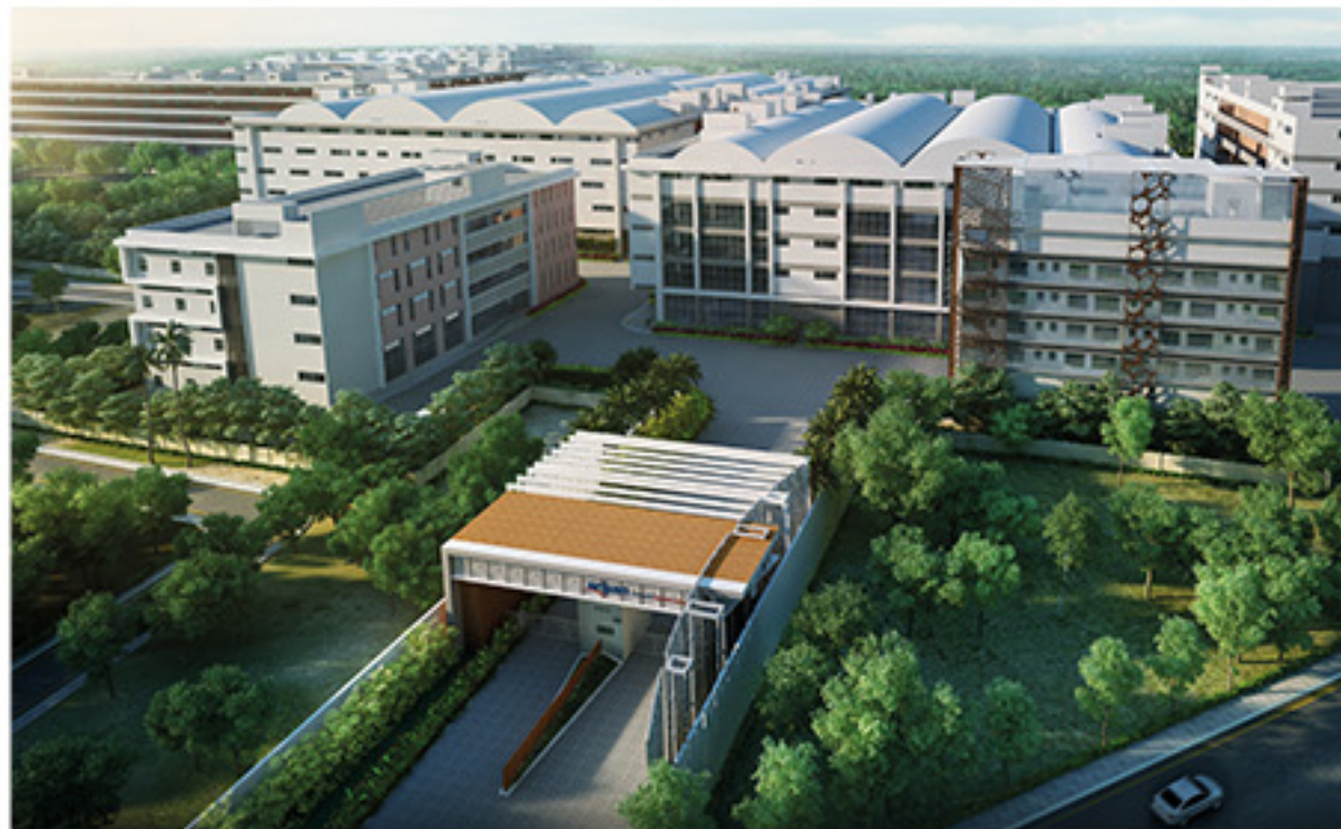
Srijan Industrial Logistic Park NH6