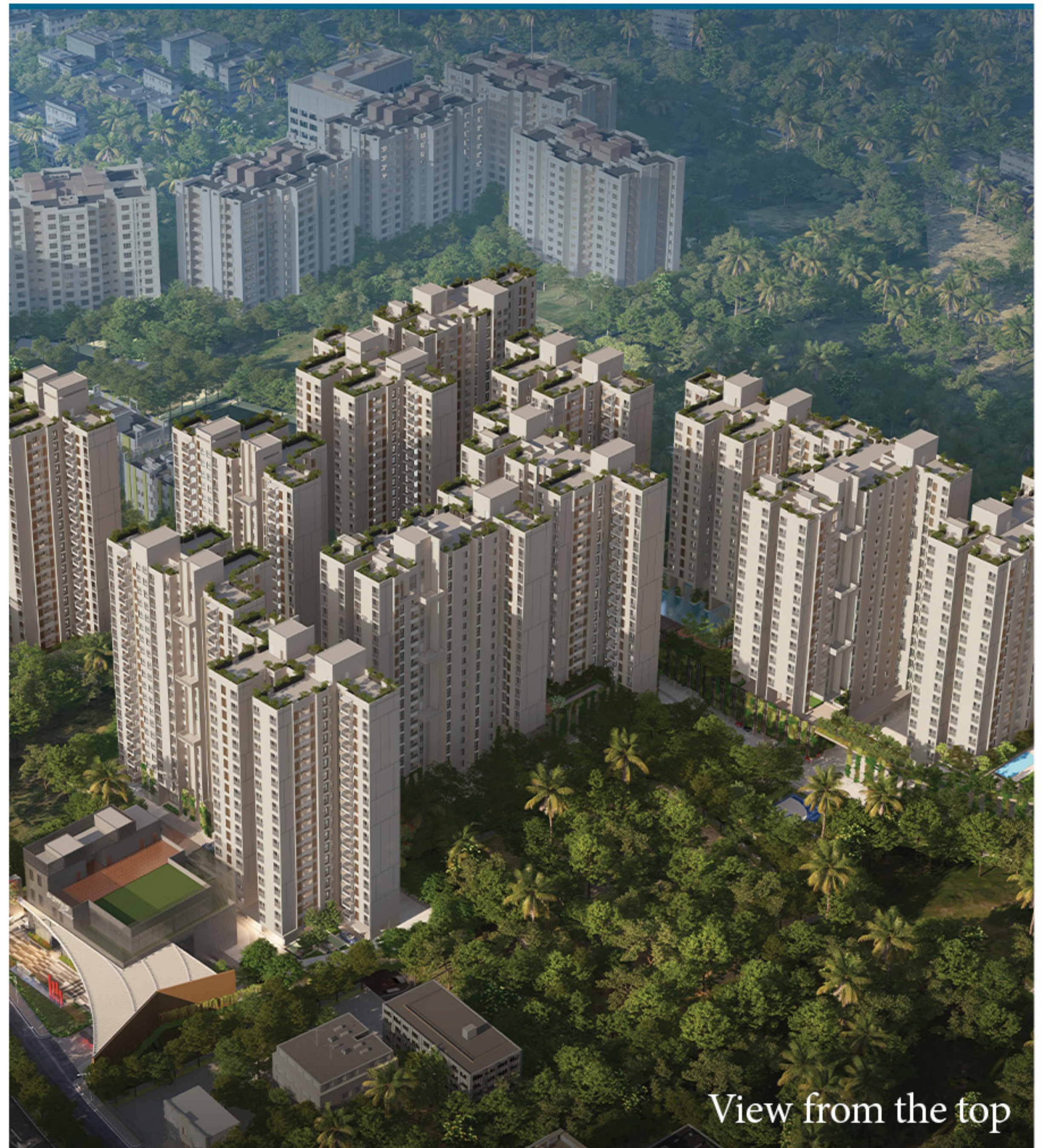
View from the top