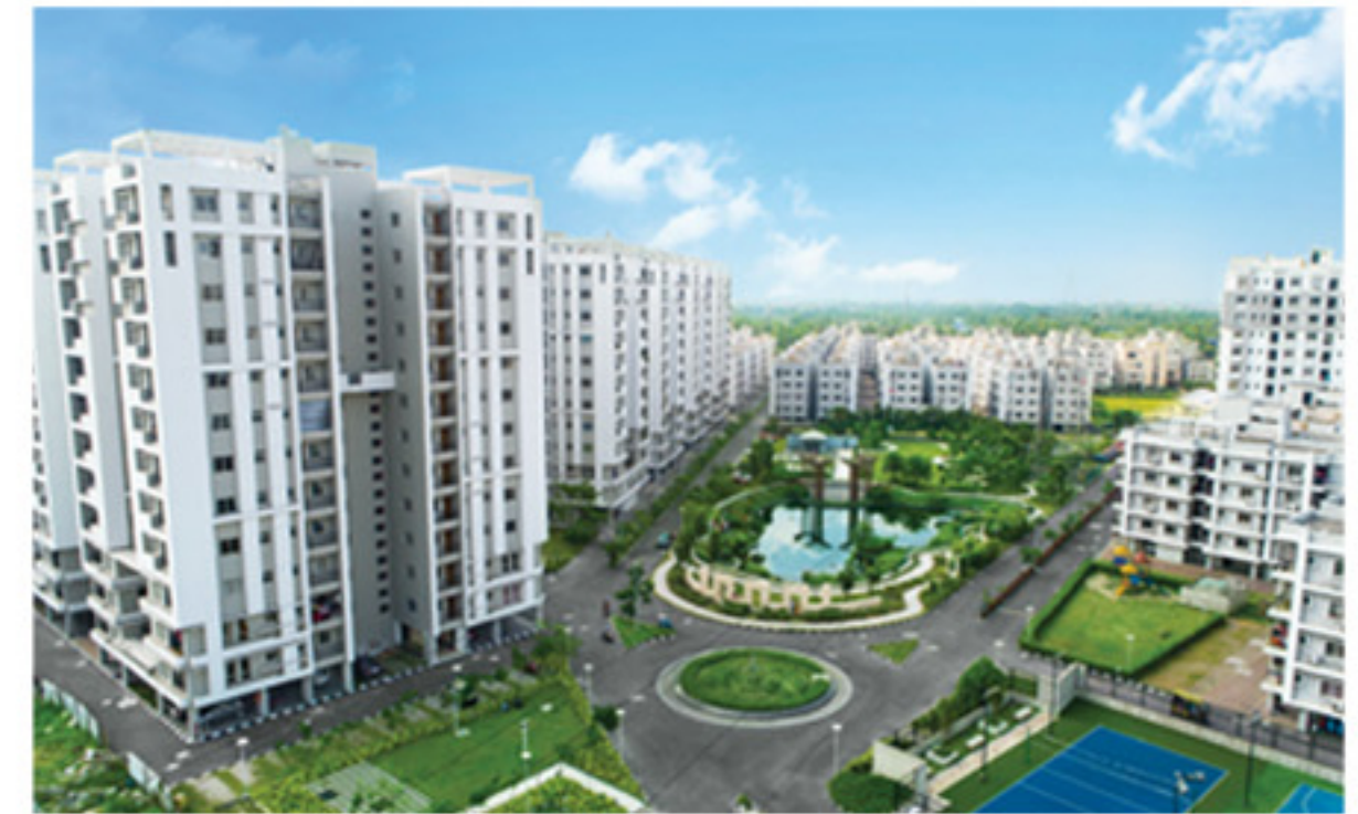
Greenfield City near Behala Chowrasta Metro