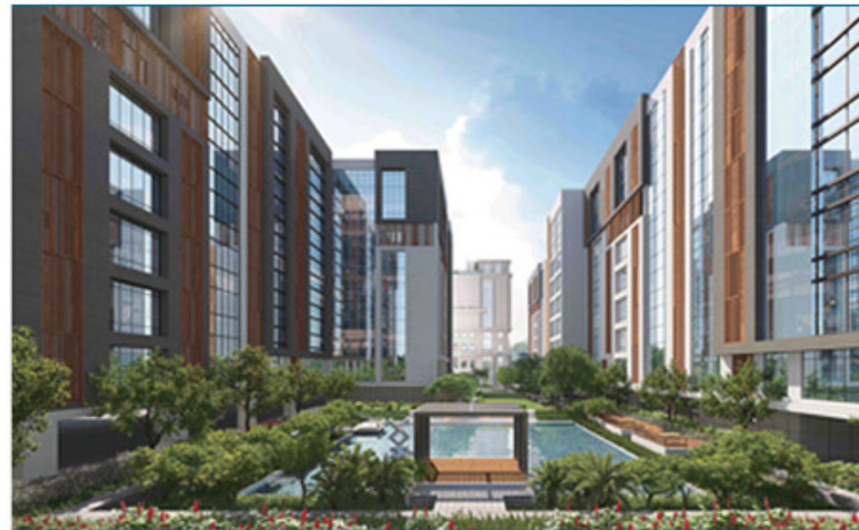
Intellia near Park Street