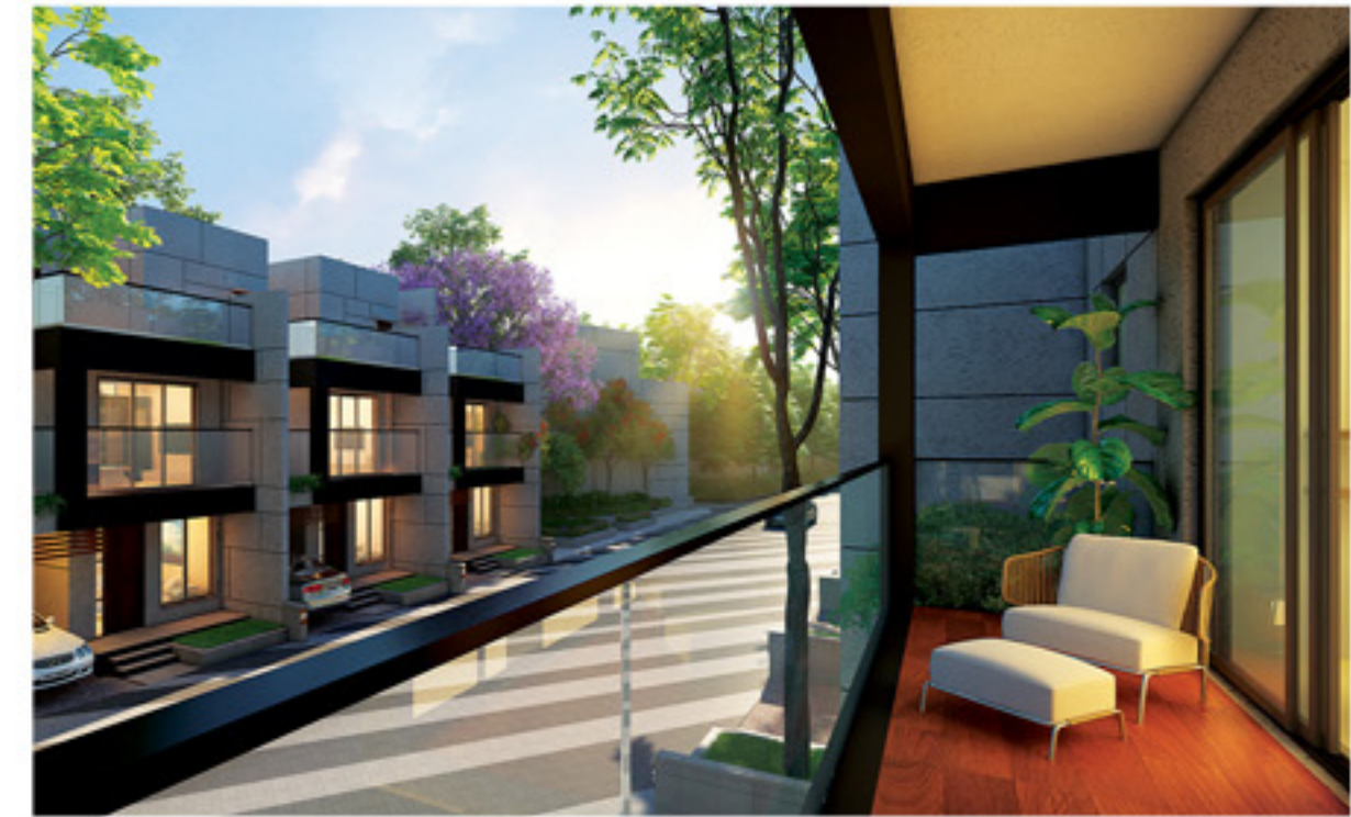
Botanica near Southern Bypass