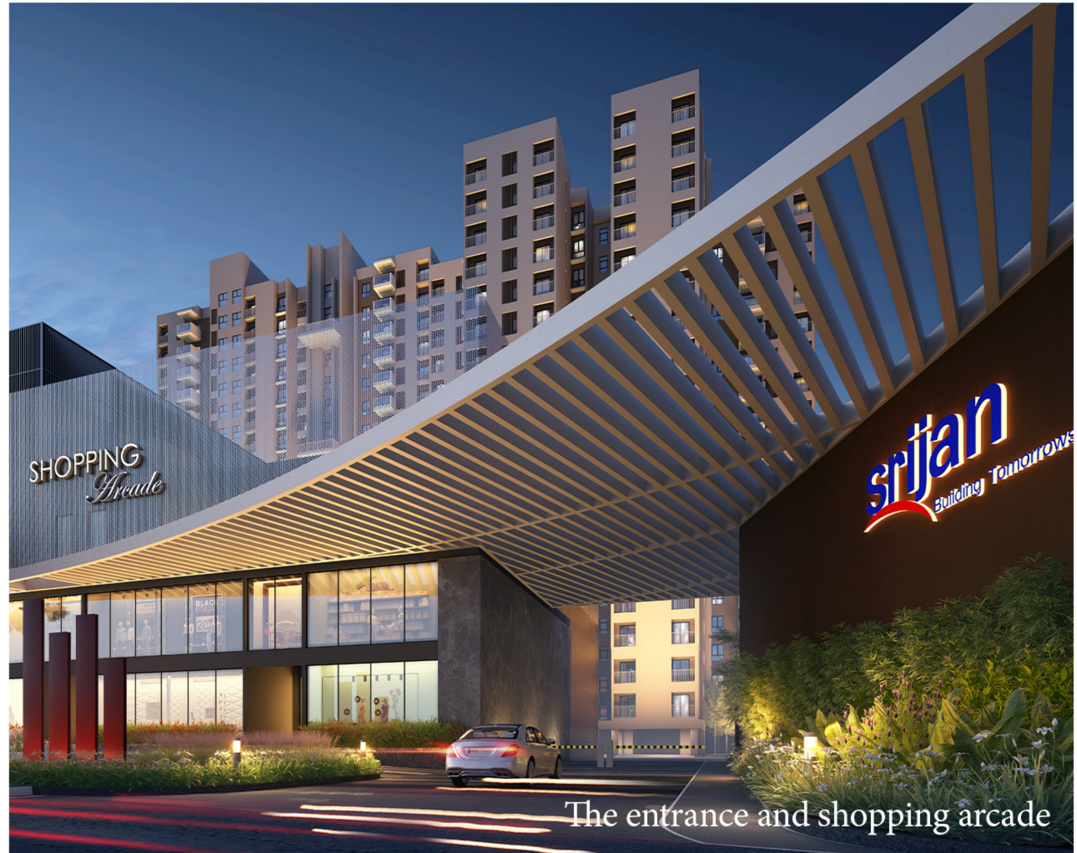
The entrance and shopping arcade

A in-house shuttle service to and from Sector V and New Town SEZ area will ensure a hassle-free daily commuting .