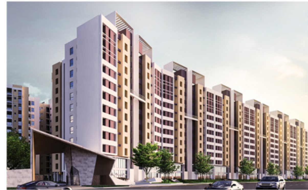
Eternis Jessore Road