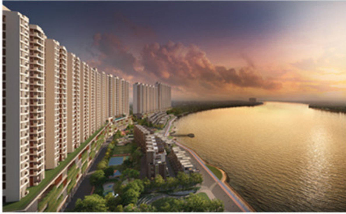
The Royal Ganges Batanagar

Srijan possess a rich track record of 24 ongoing projects of 25 million sqft, 16 upcoming projects of 15 million sqft and 34 completed projects of 12 million sqft.