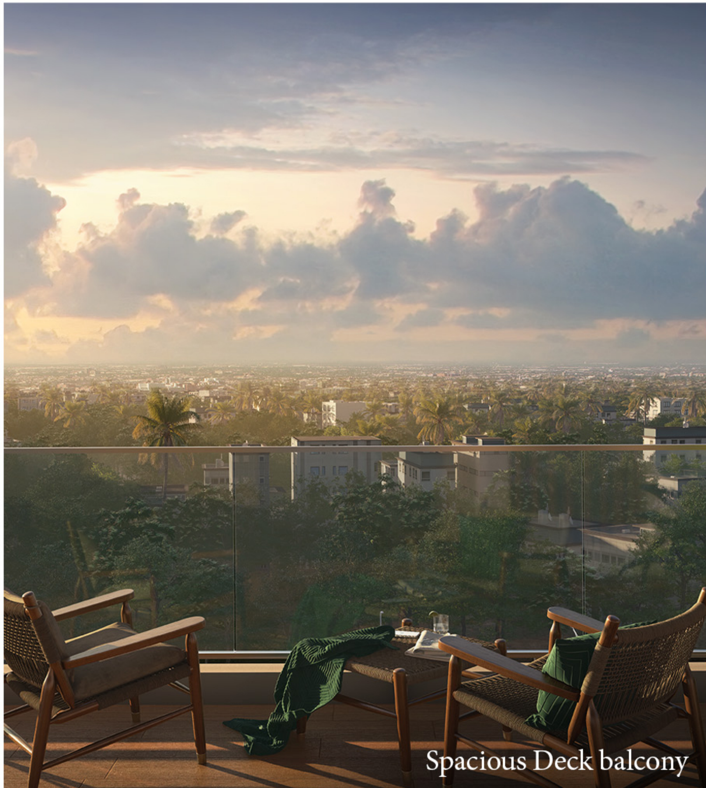
Spacious Deck balcony