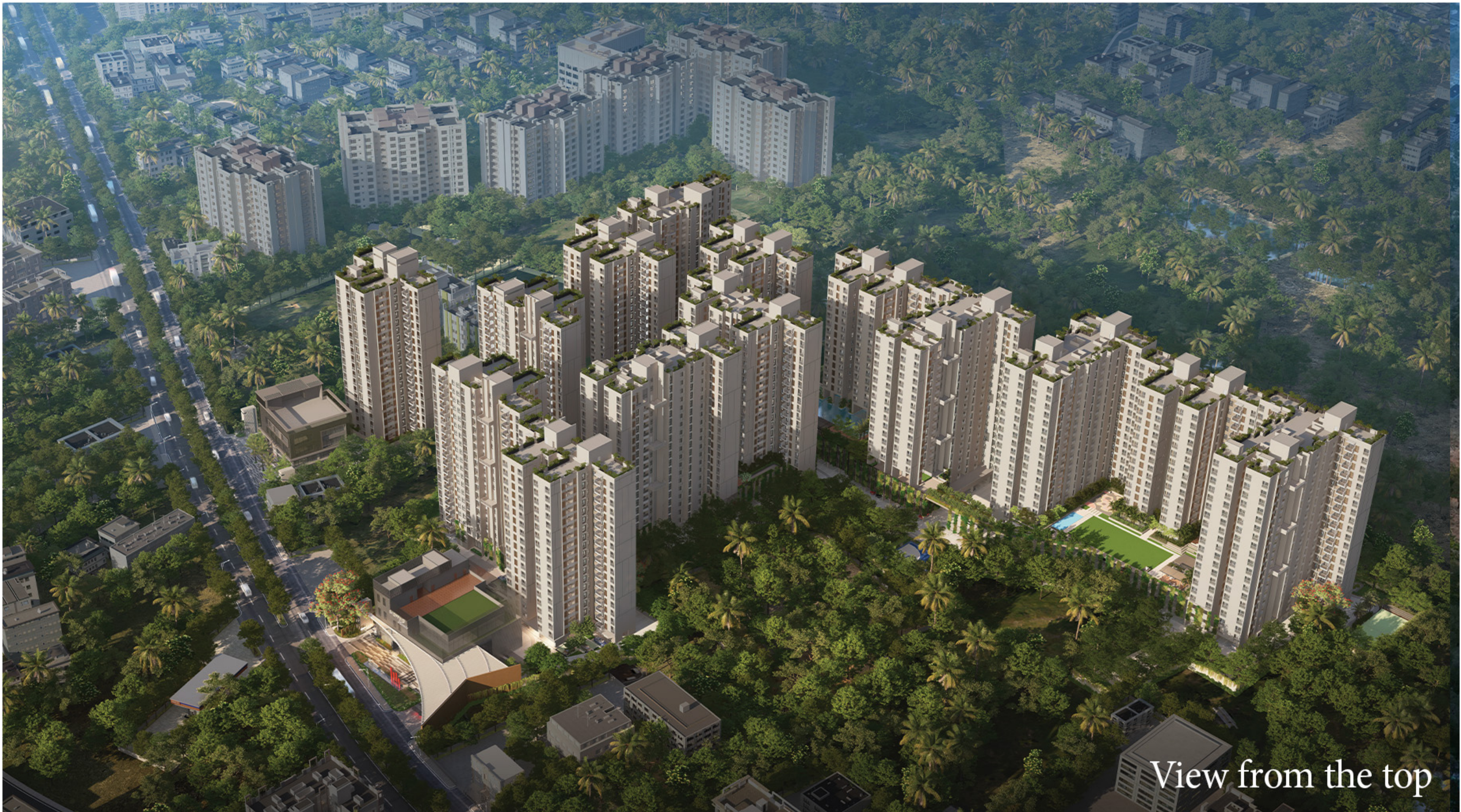
View from the top