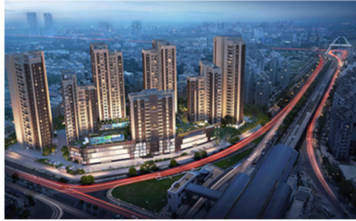
Town Square near Newtown