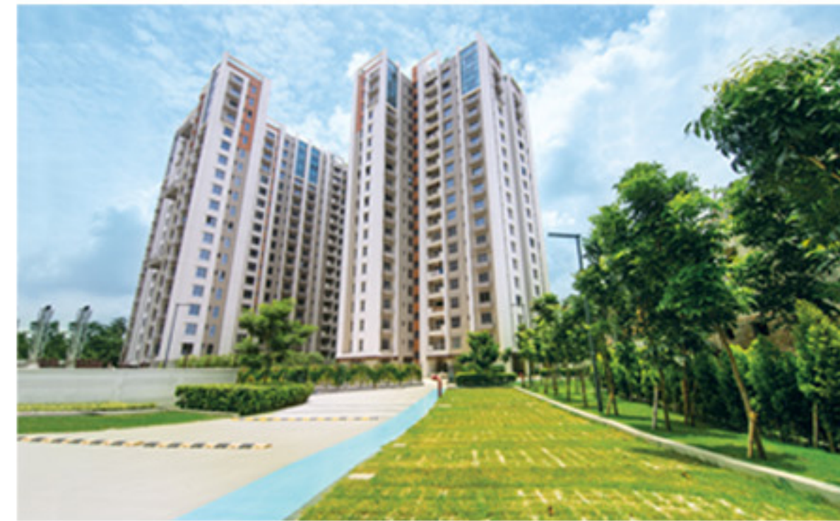
Ozone South EM Bypass