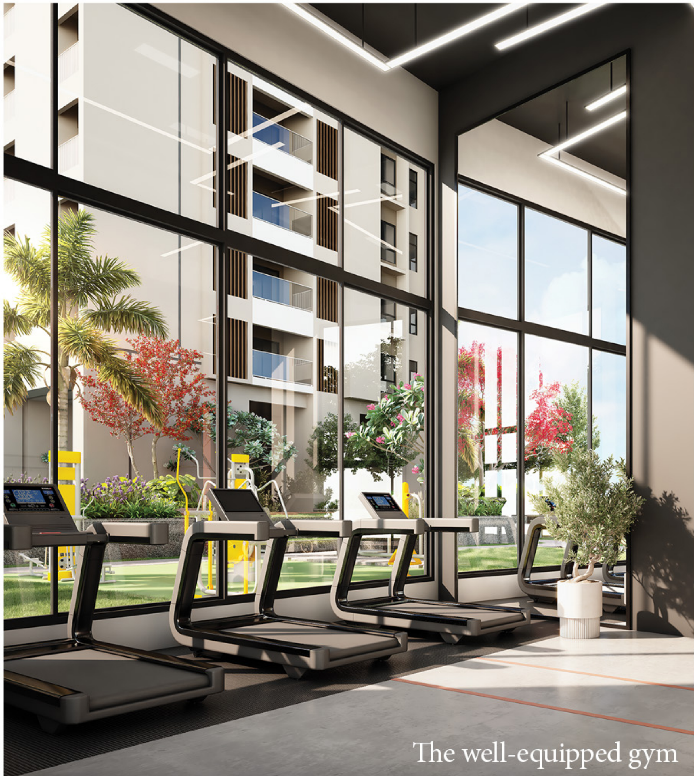
The well-equipped gym